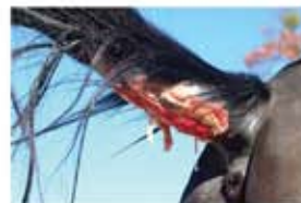
Day 1 of application

In addition, it does not stimulate exuberant granulation tissue (proud flesh). Zn7 can be used on exposed or bandaged areas.