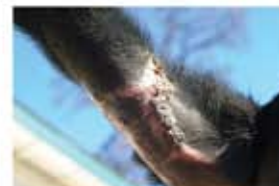
Day 36 of application